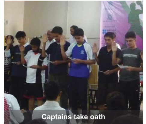
Captains take oath