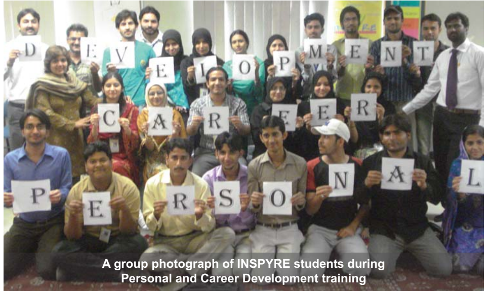
A group photograph of INSPYRE students during Personal and Career Development training

The Personal and Career Development Module is a crucial component of the INSPYRE learning framework. The module has multi-faceted elements where students are facilitated to: