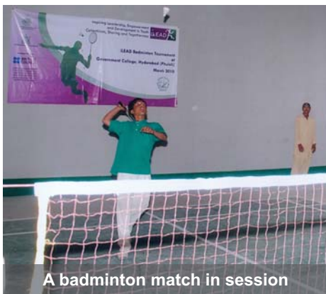
A badminton match in session

کھیل انسان کی جسمانی صلاحیتوں کے ساتھ ساتھ اسکے اخلاق، قائدانہ خصوصیات اور حالات سے مقابلہ کرنے کی صلاحیت پیدا کرتا ہے۔ ڈاکٹر مرزا امام علی بیگ