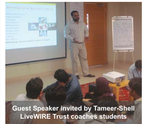
Guest Speaker invited by Tameer-Shell LiveWIRE Trust coaches students

The Institute for Advancing Careers and Talents (iACT) encourages its students to garner entrepreneurial traits such that they are self-driven and motivated to start their own business. For interested students, Bright Ideas workshop was organized at iACT in collaboration with Tameer-Shell LiveWIRE Trust. 40 students attended, and were given information on how to start and run businesses. Students came up with great ideas, and will polish them further under the guidance of iACT faculty members and with the facilitation of the team from Tameer-Shell LiveWIRE Trust.