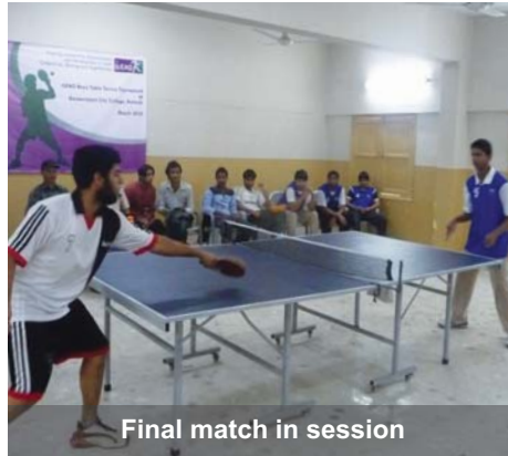
Final match in session

Dr. Muhammed Ali Shah, Minister for Sports, Government of Sindh attended the closing ceremony. He lauded the efforts of the college to promote sports, pledging to help it gain access to a cricket ground to facilitate practice of young athletes.