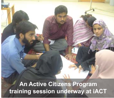
An Active Citizens Program training session underway at iACT

Active Citizens Program aims to instill a sense of responsibility in Pakistani youth. It encourages youth to work for community development. Organized for current students, alumni and other learners, these trainings were completed at iACT in March 2010. Habib University Foundation also facilitated program implementation at Karachi University, engaging students from the Women's Studies Department.