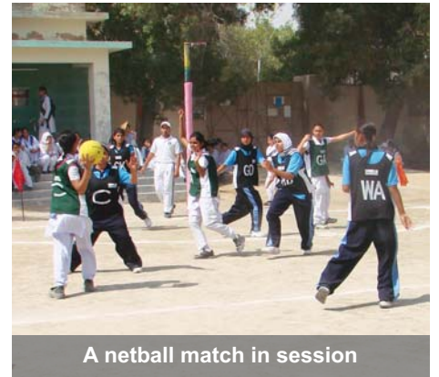
A netball match in session