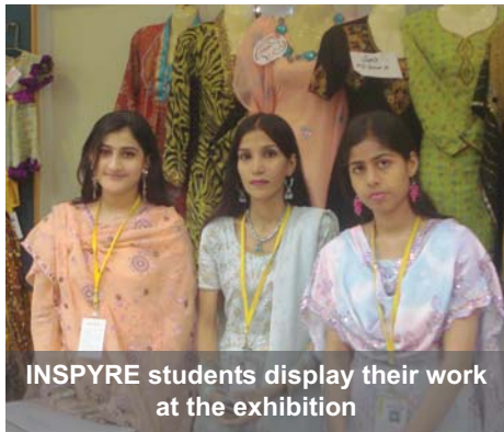
INSPYRE students display their work at the exhibition

Developing students as entrepreneurs is one of iACT's focus areas. An exhibition was organized and managed at the Institute by INSPYRE Textile Designing and Fashion Designing students, where their work was displayed. Not only was there a large variety of work, but it was also excellently done.