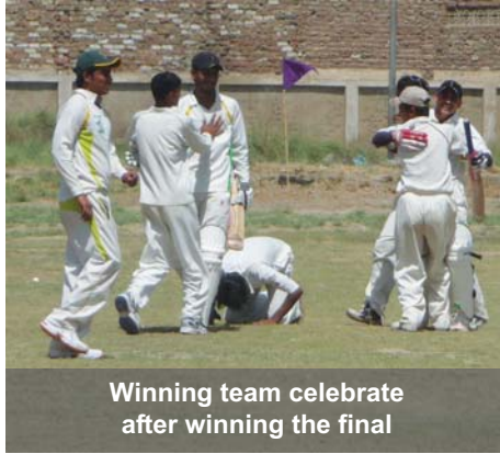
Winning team celebrate after winning the final